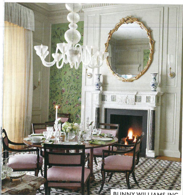
BUNNY WILLIAMS INC.