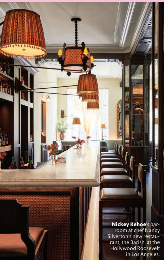
Nickey Kehoe's barroom at chef Nancy Silverton's new restaurant, the Barish, at the Hollywood Roosevelt in Los Angeles.