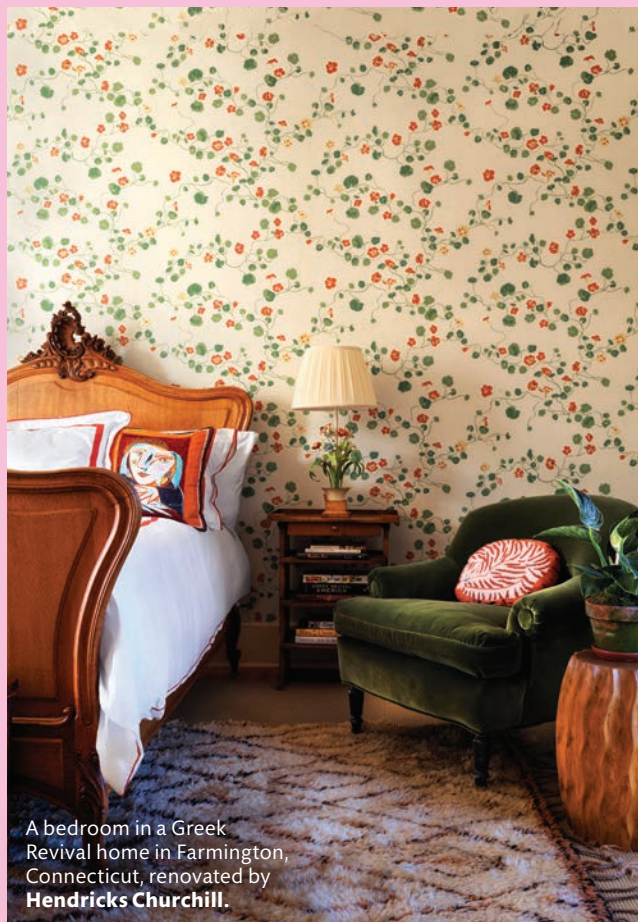
A bedroom in a Greek Revival home in Farmington, Connecticut, renovated by Hendricks Churchill.